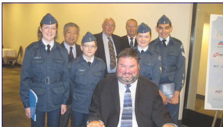
FOREGROUND: STEVEN FLETCHER MINISTER OF STATE (TRANSPORT)

The Council, which are strong supporters of the Air Cadet Program, recently held their 2011 convention in Winnipeg, to which several Air Cadets were invited to observe the activities. On Friday October 21 a Luncheon was held with the Honourable Stephen Fletcher, Minister of State (Transport) and Member of Parliament for Charleswood—St. James—Assiniboia at which Air Cadets were again invited.