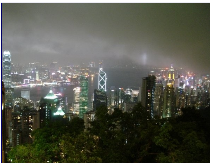
VIEW OF HONG KONG FROM VICTORIA PEAK