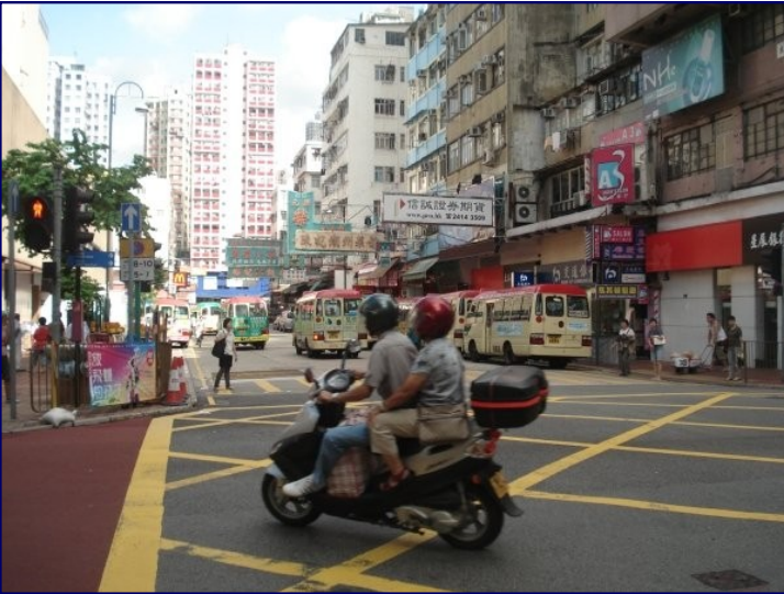
HONG KONG STREET SCENE