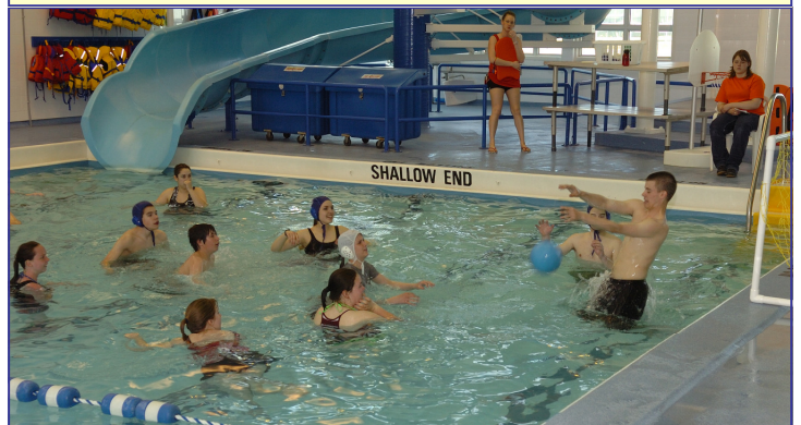
AND NOW FOR SOMETHING COMPLETELY DIFFERENT...FUN!