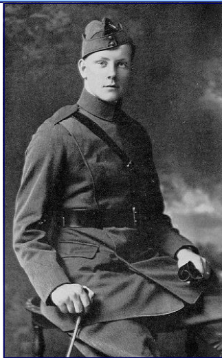
ALAN ARNETT MCLEOD, V.C.

Stonewall and area youths who wish to join the Air Cadets, can attend this parade night. During this time you will be able to complete an application which will require your signature and that of your parent or legal guardian (so please bring them along to expedite the processing). You will be required to produce your birth certificate and your parent or legal guardian's Manitoba Health Registration.