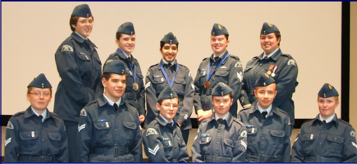
2009 EFFECTIVE SPEAKING COMPETITORS

The 2009 Manitoba Effective Speaking Competition was held on February 22 at 17 Wing in Winnipeg with several parents and friends in attendance. Eleven cadets from seven squadrons competed to represent Manitoba at this year's National Competition in St. John's, NL.