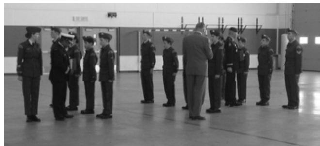
Judges Inspecting the Brandon Team

Well done 82! The planning has started for the 2007 Glen Elwood so the challenge is out to all the rural squadrons to come out and show their skills.